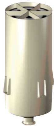
Steam vent and blowdown silencers